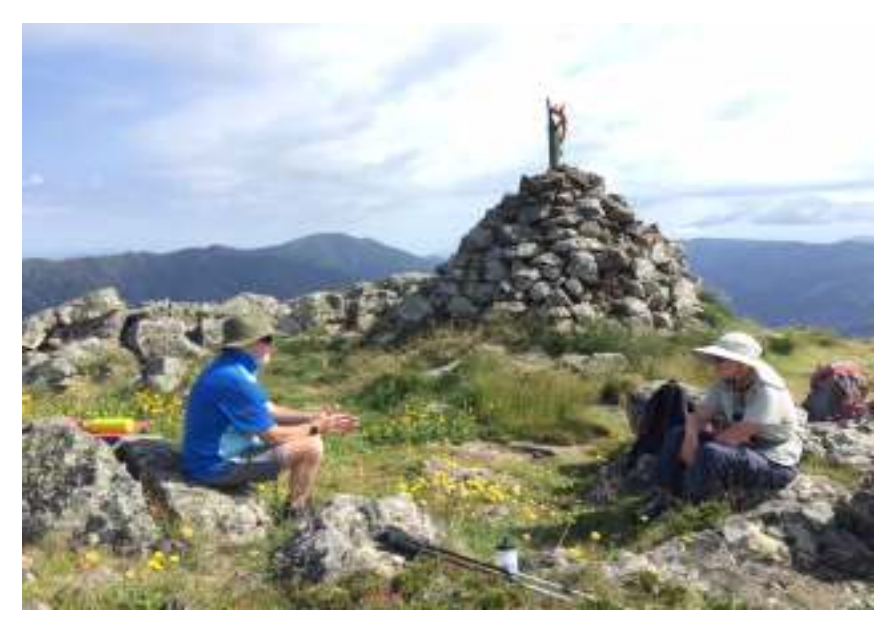
Two walkers; two mountains (Who can name all four?)