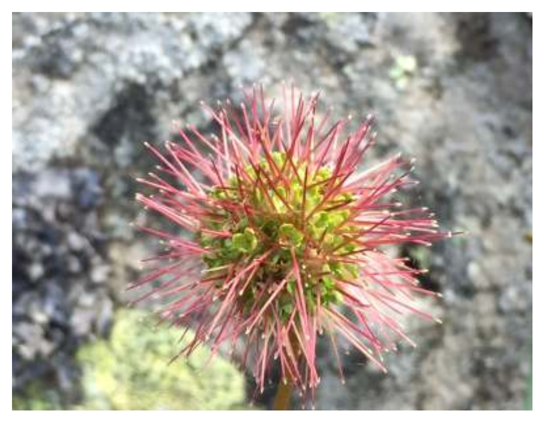
According to our leader, this is the new COVID virus