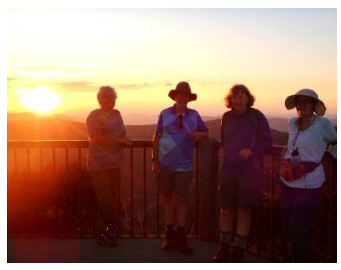
Fab Four see sinking sun