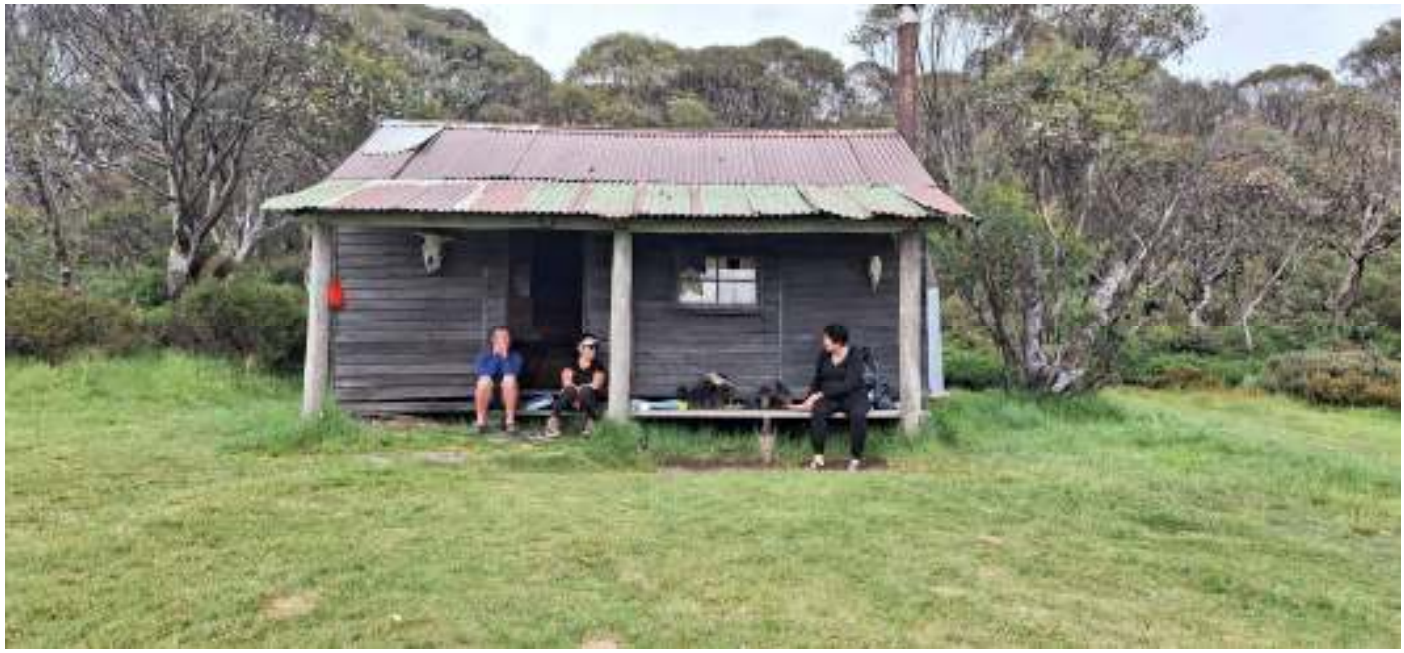
Relaxing outside Young's Hut after a long day.