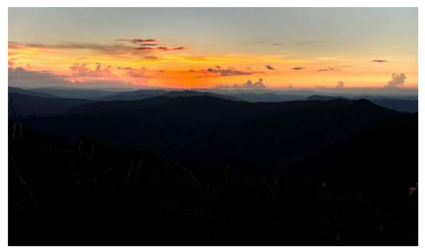
Goodnight all! Sunset from Mt Higginbotham