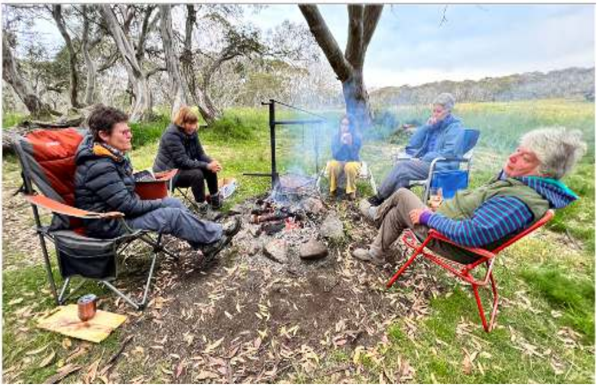
Relaxing by the campfire