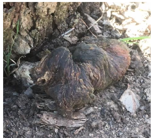
This photo of the luminous fungi was taken by Neville Bartlett. This is how it looks at night in June. The photo is from the Friends of Chiltern website gallery & appears in Footprints with Neville's kind permission.