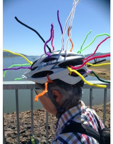
Punk bike rider.