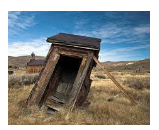
After the record was set.