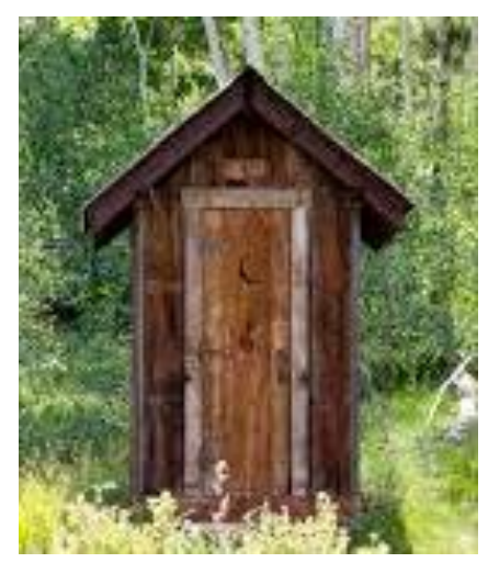
Before the record was set

We wish to thank all those hard working people who erected this magnificent edifice affording us all such pleasant relief!